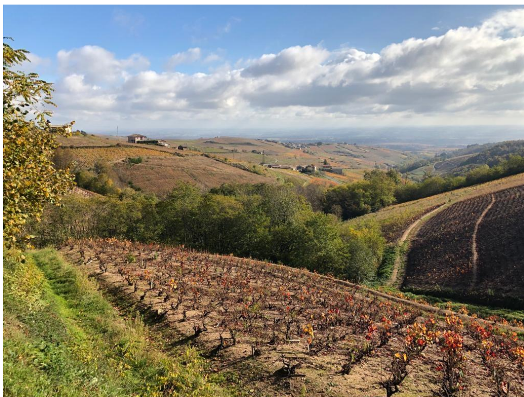
A view at the Beaujolais

It's good to see that wines from this winery have been able to keep up well with the insiders' tips and hyped wines from the region. A few lots of Pouilly-Fuissé have now also been procured.