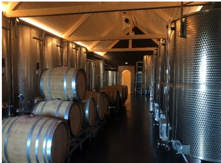
News cellar of the domaine

The red wines from Santenay (and Chassagne) are definitely benefitting from the new climactic conditions. Many renowned wine-growers have more recently been purchasing vineyards in this previously neglected municipality. The wines have been developed in the small, sophisticated new winery. Start of grape harvest 18 August!