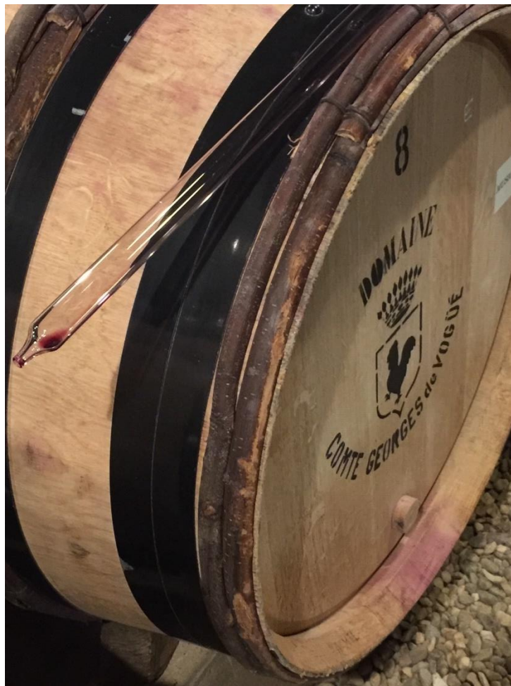
Pipette for barrel sample