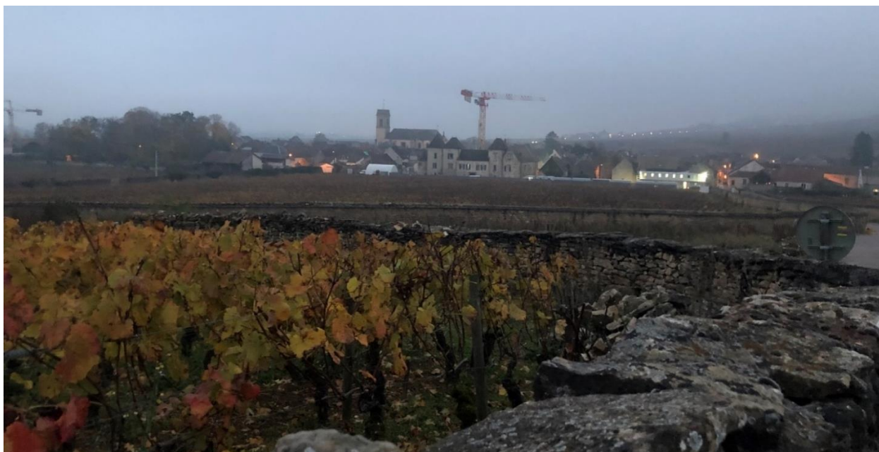
Clos Commaraine at dusk with a hint of an imposing building site